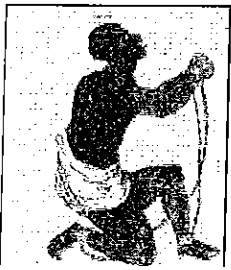
AM I NOT A MAN AND A BROTHER